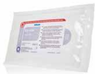
Klerwipe 70|30 IPA 200 x 200mm wipe