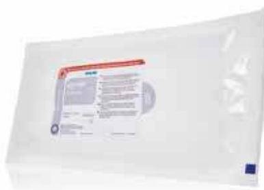
Klerwipe 70|30 IPA 300 x 300mm wipe